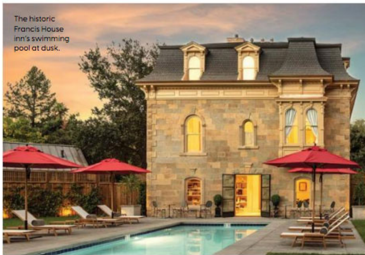
The historic Francis House inn's swimming pool at dusk.