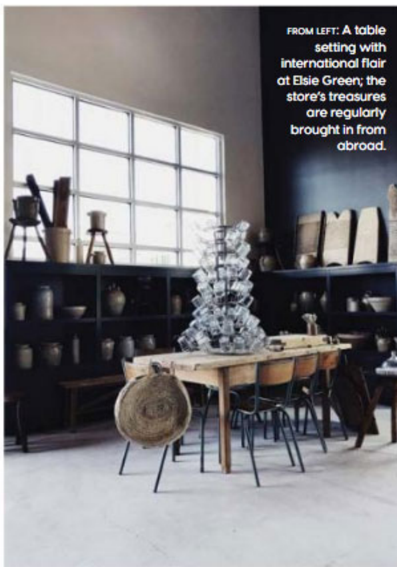
FROM LEFT: A table setting with international flair at Elsie Green; the store's treasures are regularly brought in from abroad.