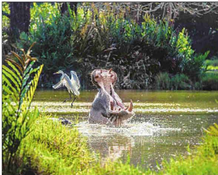
AUORE MARTIGNONI Getty Images / EyeEm

RWANDA , having emerged from violence, is popular for safaris.