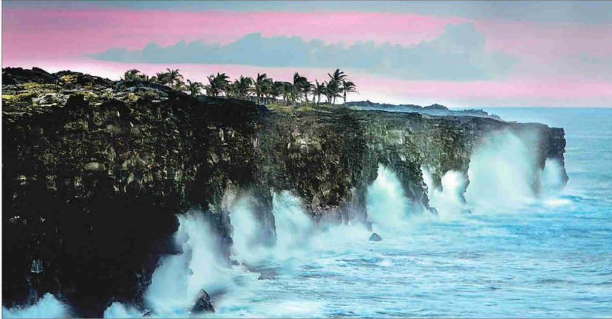
HAWAII VOLCANOES National Park on Hawaii Island, which closed in May as the Kilauea volcano began quaking and erupting, partly reopened Sept. 22. Also consider heading to the sunny Kohala Coast.